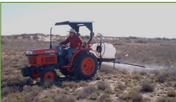
Blake Morris uses a chemical spray to treat invasive broomweed.

The Landmark has broomweed throughout its 336 acres, but it is most noticeable on the northern half of the draw. Despite the plant’s historic medicinal qualities and use as a food source for quail, its profusion on the property requires ag-