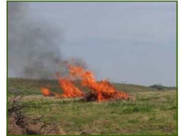
A recent prescribed burn at the Landmark.