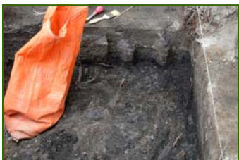
Folsom bone bed associated with one of the dark organic layer (representing the marshy edge of a pond) at Area 6 of the Landmark.

Paleoindian Folsom culture. Folsom were hunter and gatherer groups who moved considerable distances across the Plains in pursuit of bison and made exquisite stone tools, particularly the finely crafted fluted Folsom spear point.