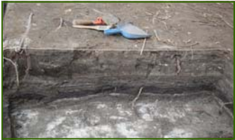
Alternating bands of organic deposits at Area 6 of the Landmark.