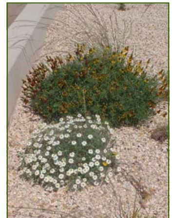
Native grasses, Mexican hat, cactus, and Blackfoot daisy in the newly remodeled bed in front of the Interpretive Center.