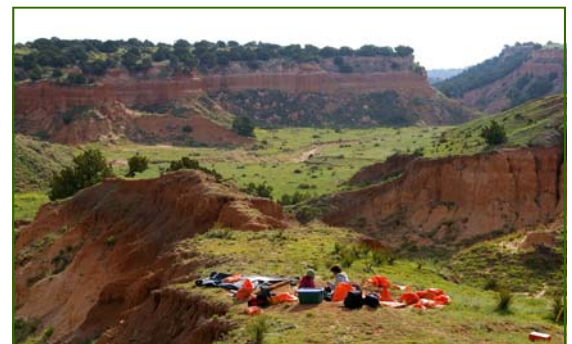
Area 5 at the San Jon site; notice the stratified deposits at the edge of the peninsula leading into Sand Canyon.

This summer's excavation revealed evidence of bison consumption from three different Paleoindian time periods. In a deposit dating 8,600 years ago, bison vertebrae were discovered with debris left over from stone tool resharpening. Several bison ribs and a foot bone were found with stone flakes that were detached from an Alibates chert knife in sediments dating to 10,000 years ago. Alibates chert is a high quality stone material that outcrops near Amarillo, Texas. The largest bison bone bed uncovered this summer, that included several connected complete vertebrae and ribs, was found in a level dating to 10,800 years ago and is associated with the