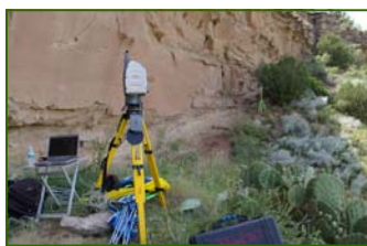
3D Leica scanner used for recording the rock art at Cowhead Mesa.